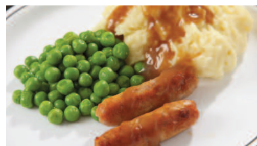
Sausages served with Mashed Potato, Seasonal Vegetables & Gravy