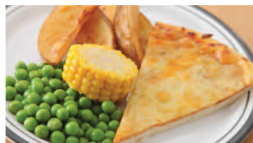
Cheese & Tomato Pizza, served with Potato Wedges & Seasonal Vegetables