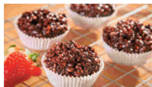
Chocolate Crispy Cake