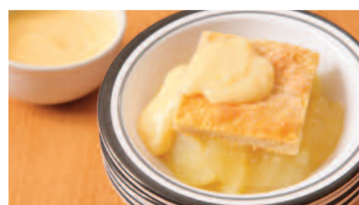
Apple Pie & Custard