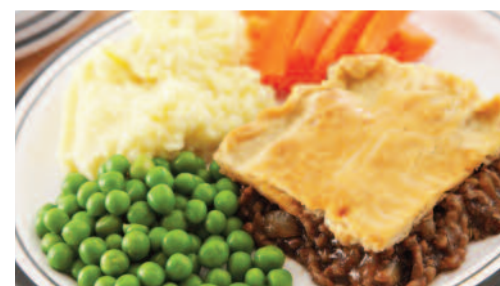
Homemade Mince Beef Pie served with Mashed Potatoes & Seasonal Vegetables