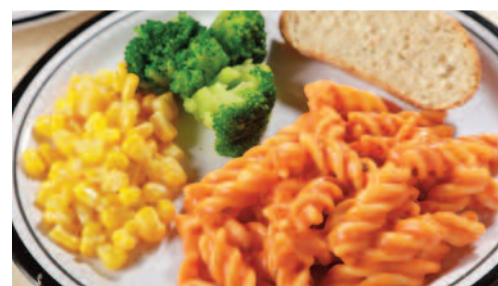
Tomato & Mascarpone Cheese Pasta served with Garlic & Herb Bread and Seasonal Vegetables