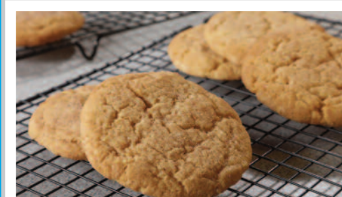
Snicker Doodle Biscuit

AVAILABLE EVERY DAY – UNLIMITED SALAD, FRESHLY BAKED BREAD, FRUIT YOGHURT & FRESH FRUIT PLATTER. FOR ALLERGEN INFORMATION, PLEASE ASK ONE OF OUR CATERING TEAM. ALL THE ABOVE DISHES ARE SUBJECT TO AVAILABILITY.