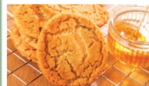
Golden Crunch Cookie

AVAILABLE EVERY DAY – UNLIMITED SALAD, FRESHLY BAKED BREAD, FRUIT YOGHURT & FRESH FRUIT PLATTER. FOR ALLERGEN INFORMATION, PLEASE ASK ONE OF OUR CATERING TEAM. ALL THE ABOVE DISHES ARE SUBJECT TO AVAILABILITY.