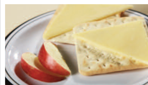
Cheese & Crackers