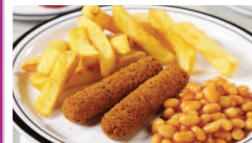
Breaded Mozzarella Sticks served with Chips & Peas or Baked Beans