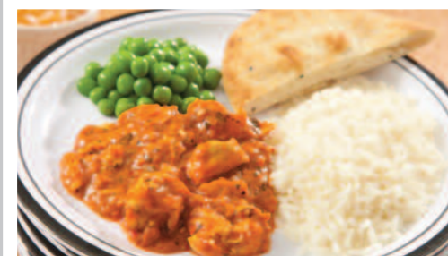
Chicken Tikka Masala served with Rice, Naan Bread & Seasonal Vegetables