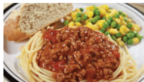
Spaghetti Bolognese served with Garlic & Herb Bread and Seasonal Vegetables