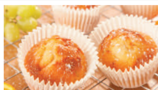
Apple & Cinnamon Muffin