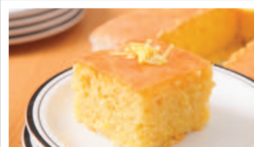
Lemon Drizzle Cake